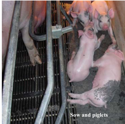
Sow and piglets

Another pit gas of concern, hydrogen sulfide, can kill an individual after one or two breaths in concentrations of above 600 ppm, according to Michigan State University.