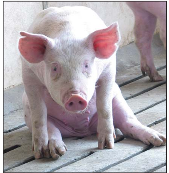
Polly the Pig™.

Ask about our annual “Manure Route” Service Plan