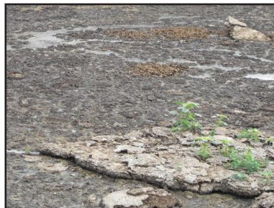
Crusting/solids before product use

ProfitPro has been treating the east half for about nine months. A few things really stood out from his experience: 1) He noticed a reduction in the amount of flies from when he shut the curtains up last fall. 2) He smelled less ammonia from the treated side vs. the non treated side. 3) He also observed the uniformity of the field application with the treated manure in comparison to the untreated. His hauler uses GPS mapping, integrated with a flow meter, and the difference was easy to see. The treatment process liquified the manure from top to bottom, which resulted in more uniformity in the manure and application on the field.