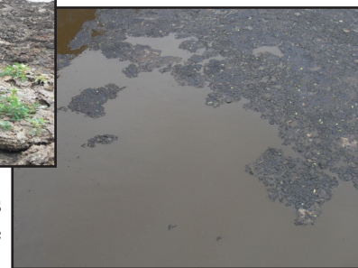
Reduced crusting/solids after product use